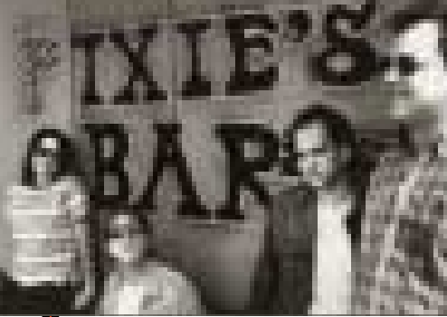
The Pixies in the late '80s. From left: Kim Deal, David Lovering, Joey Santiago and Frank Black

I was talking to preachy-preach about kissy-kiss He bought me a soda He bought me a soda He bought me a soda and he tried to molest me in the parking lot